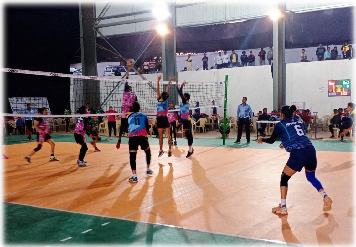
A action moment from the match between Rajasthan and Haryana Women teams