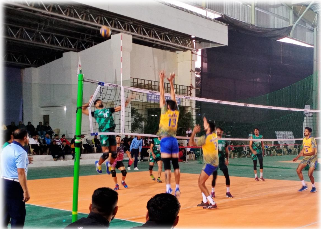
A moment from the match between Rajasthan and Punjab Men Teams